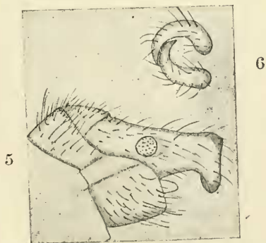
Fig. 5.—Apex of abdomen from side of Boriomyia persica , ♂. 6.—Apex of appendages of Boriomyia persica , ♂, from beneath.

Head yellowish above, face shining brownish; thorax above yellowish,